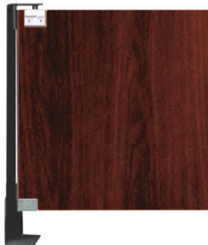
Eliason Gate Solution

The solution is the Eliason Gate and Post System (patent pending) designed for use with any of our custom gate products. The system is strong, easy to install and will work in any gate opening.