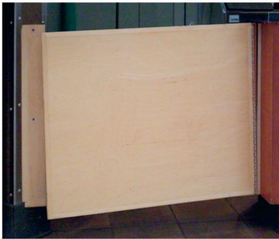
Competitor Gate Solution

Why drill holes into your new counters and cabinets to install a gate that you know will eventually fall off anyway?